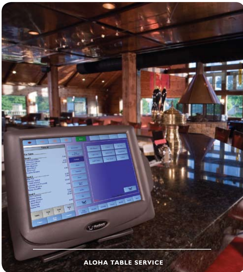
ALOHA TABLE SERVICE

Aloha Table Service helps you to increase sales, deliver exceptional customer service, eliminate waste by ensuring order accuracy, reduce POS training for staff and increase control of your operations. With powerful and easy-to-use POS technology, you can focus on what matters most – serving your customers and growing your business.